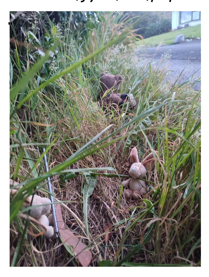
Let's have a nice dandelion to our victory!"