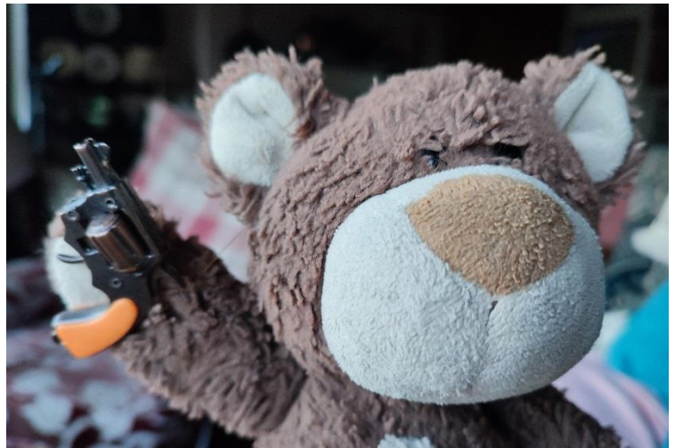
"Run, rabbit, run!"