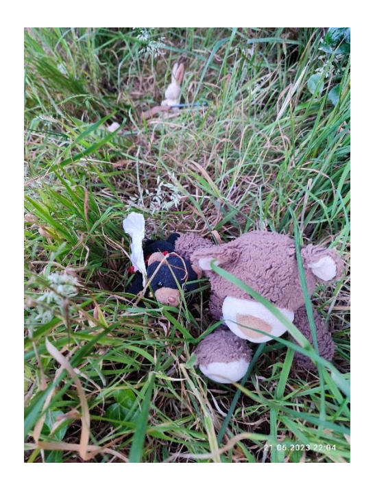
"Sorry there must be something of a misunderstanding... just walking... and we were leaving just now anyway...."