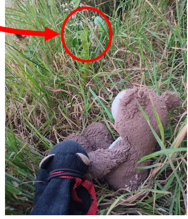
"We chased him away. We are heros!"