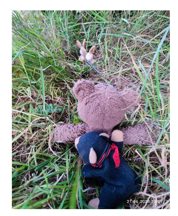
and has upgraded his defence!"